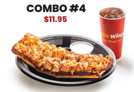
SINGLE PIZZA STICKS & 20oz DRINK