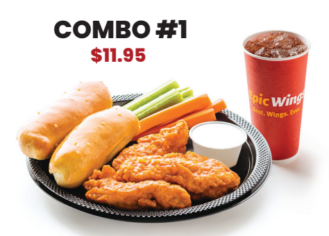
3 PC TENDERLOIN STRIPS & 20oz DRINK