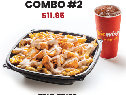
EPIC FRIES & 20oz DRINK