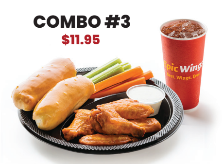
5 PC BONE-IN WINGS & 20oz DRINK